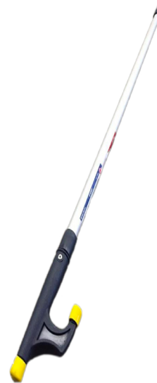
TELESCOPIC GRABBING HOOK DEVICE